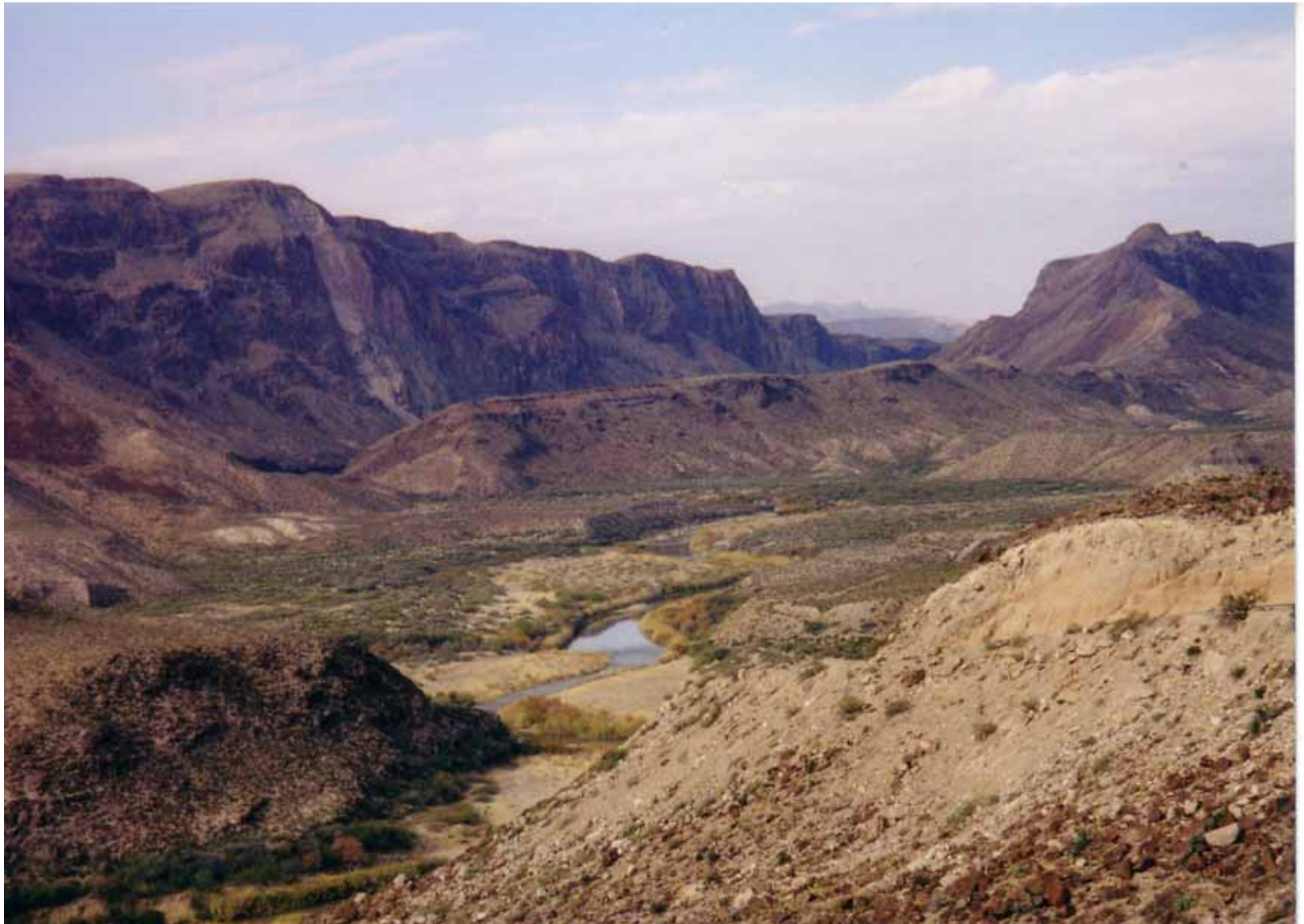
Rio Grande, near Big Bend