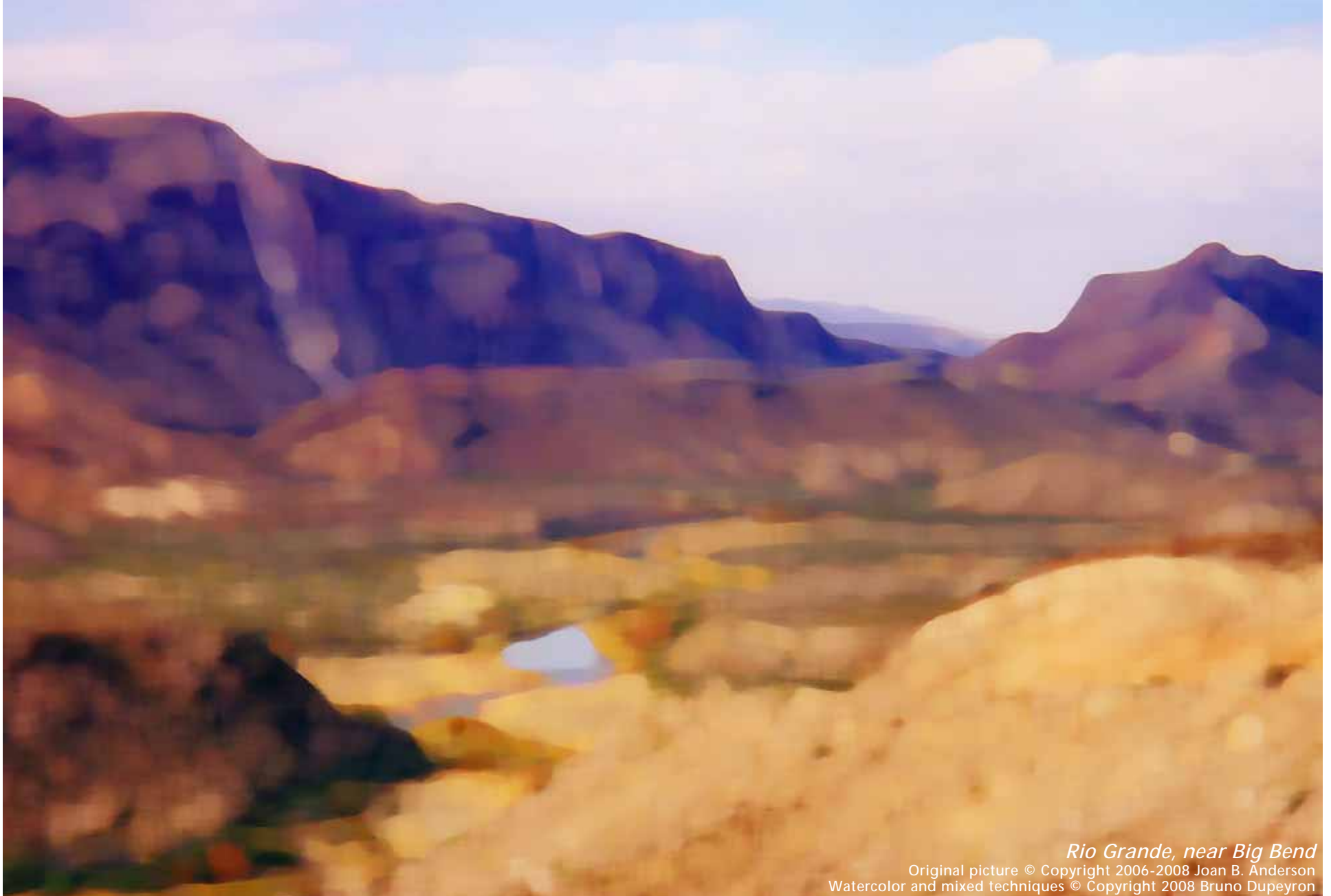
Rio Grande, near Big Bend

ABS Executive Secretariat · School of Public Administration, University of Victoria PO Box 1700 STN CSC · Victoria British Columbia V8W 2Y2 Canada · Fax (250) 721-8849 · E-mail absexec@uvic.ca